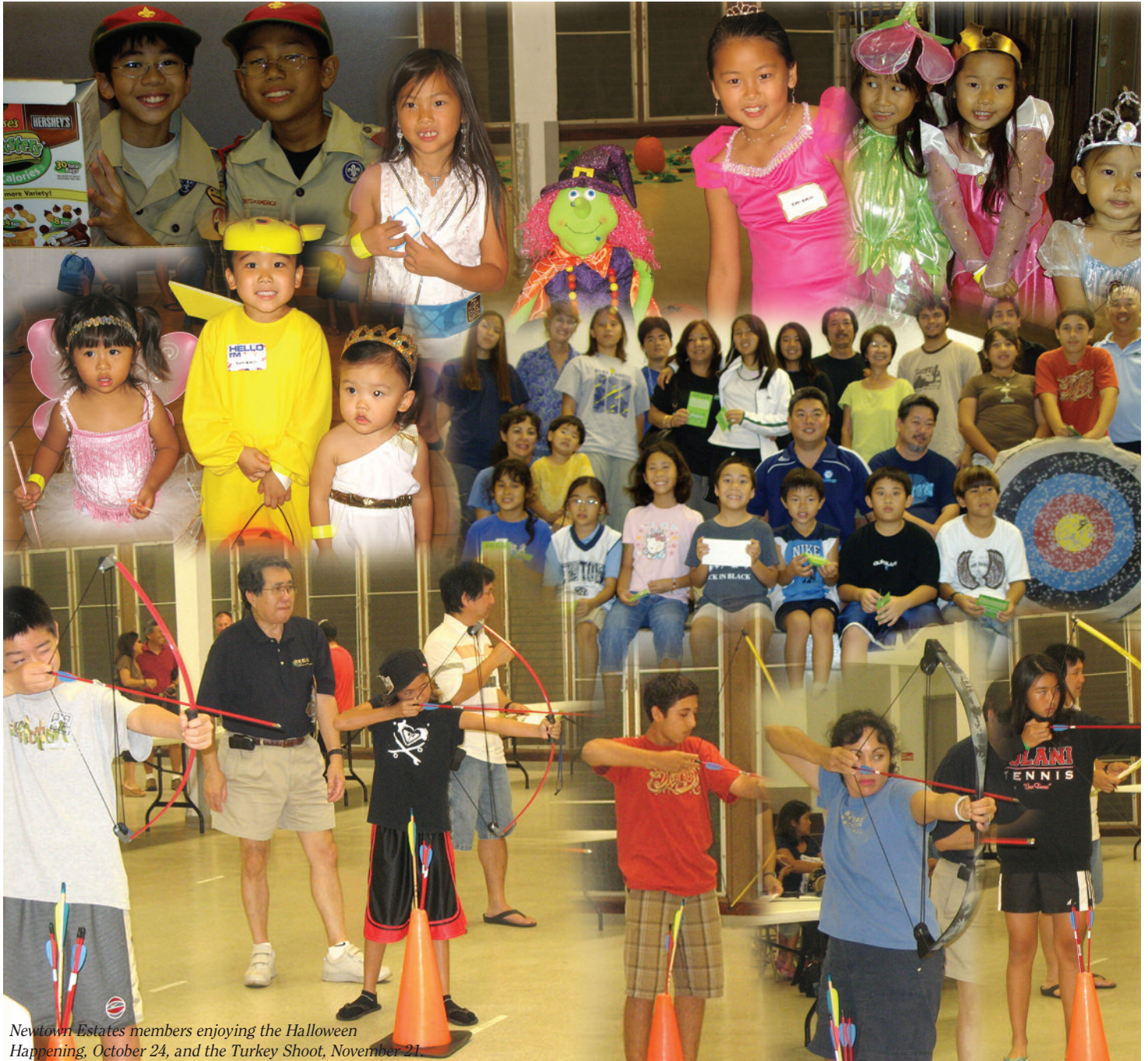
Newtown Estates members enjoying the Halloween Happening, October 24, and the Turkey Shoot, November 21.

Presorted Standard U.S. Postage Paid Honolulu, HI Permit No. 684