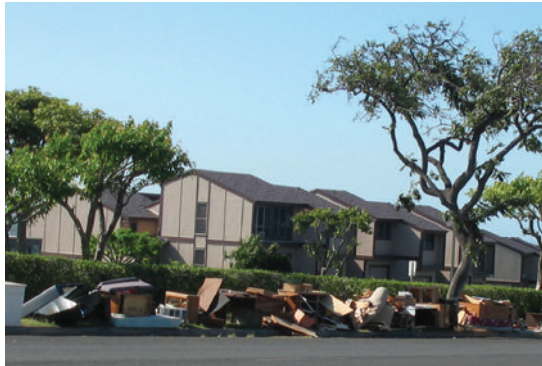
Due to blatant disregard of the City & County bulk item regulations, this is what sidewalks around Newtown Estate have looked like recently. Please kokua, this is your back yard.

Newtown Estates Community Association has a new e-mail address: newtownestates@hawaii.rr.com